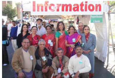
Reception committee members/volunteers

4. Shoe and coat section: We had shoe racks to accommodate 500 pairs of shoes and coat rack to accommodate 300 jackets. Youth volunteers again assisted people who need help and always kept this section in order.