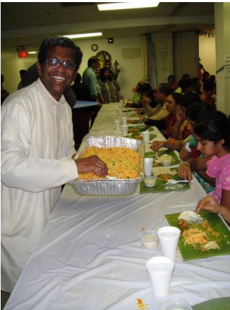
Left : Devotees served in banana leaf

Thanks to all the Grocery donors and Prasadam Sponsors. On Diwali day (Oct 17 th ) temple served annadanam using the donated grocery for 2000 visiting devotees for 10 hours continuously. Once again many thanks to more than 130 volunteers who helped making annadanam for the event.