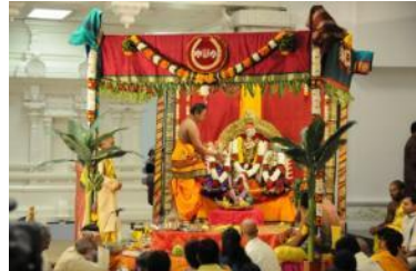
Picture of the tent decoration