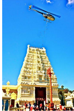
Devotees are blessed by all the priests from the helicopter