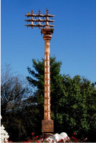
Picture of dwajasthambam in front of Rajagopuram.

All the devotees also participated and really enjoyed what we want, poojas and homas and got the blessing of the God. In this occasion to thank again all the volunteers who helped to make this event a great success. One more time I have to stress the importance of volunteers without which any event will be successful. It is our responsibility to praise all the Priests who did a great job.