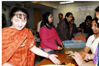
Down: Volunteers cutting vegetables.