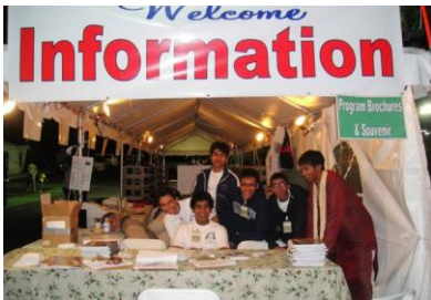
Youth group volunteers