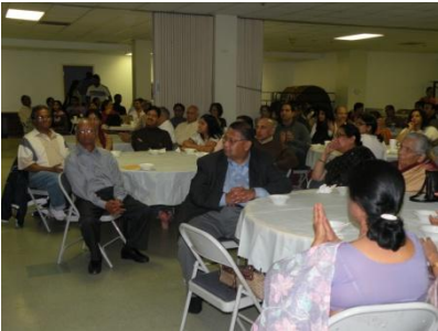
Volunteers listening to the thank you notes.