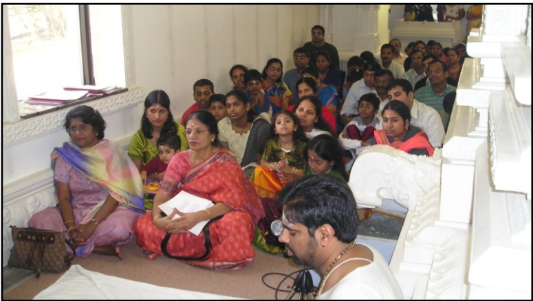
(The devotees at Lord Murugan Shrine celebrating Thaipooam)

Lord Murugan devotees attended Thaipooam festival on Sunday the 8 th February 11.00 am. Abhishekam and special alankarana was done for Lord Murugan.