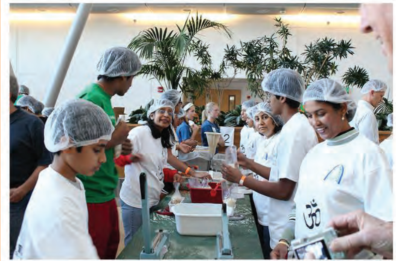
World Food Day Commoration 2010: Day 2

The Donald Danforth Plant Science Center organized a World Food Day to pack meals to feed the hungry people in Africa on Oct. 15 th -16 th . Our temple donated $200.00 towards this cause and the youth members participated in bagging meals on the 16 th .